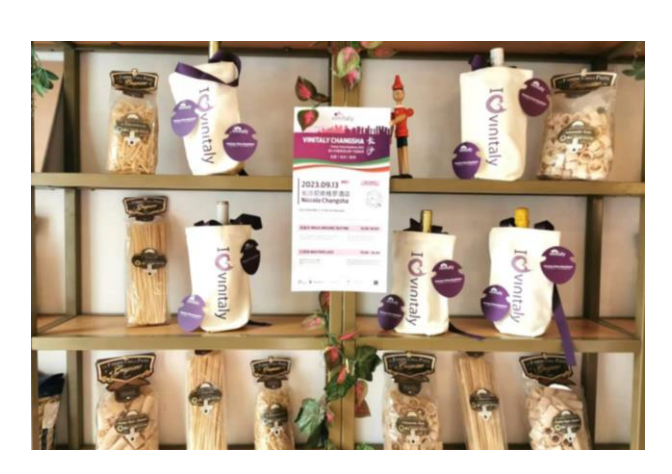
Italian Wine Week